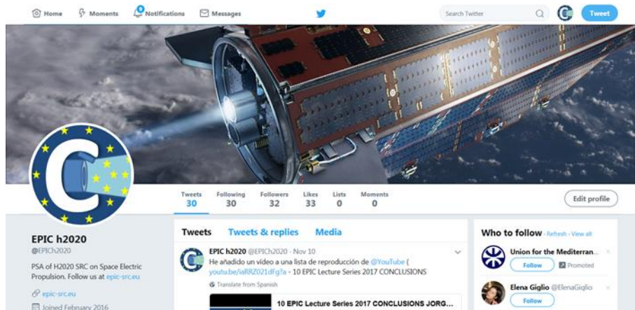
Figure 6.3.1: EPIC Twitter @EPICh2020