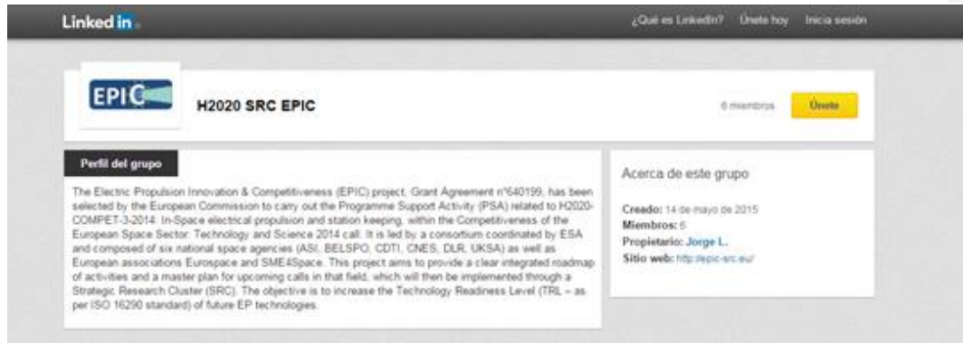
Figure 6.3.3: EPIC Group in LinkedIn