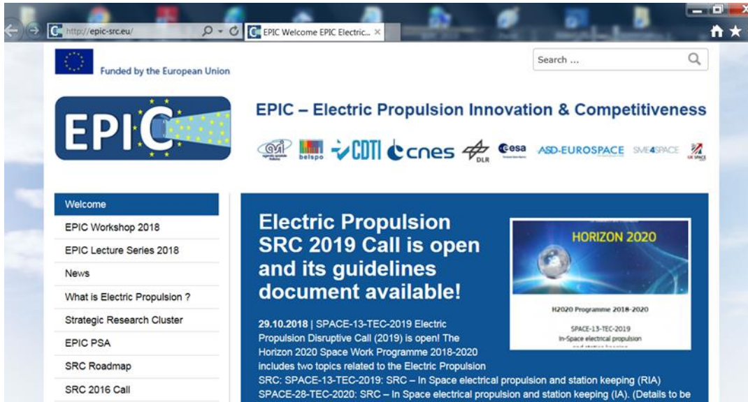
Figure 6.1.1: EPIC website Main Page

At the moment, the EPIC website looks as shown in the following Imaging Print (Only the Main Page is shown).